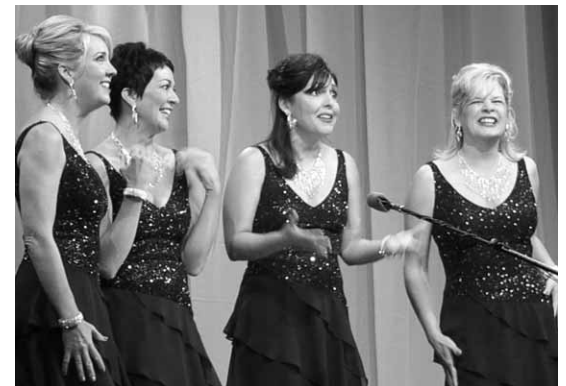
Razzcals "cash-in" yellow ribbons for bonze medals as they place third in quartet competition!

The 60th International Sweet Adeline Convention & Competition was held in Las Vegas, Nevada, October 10-14, 2006. It was the largest Convention since the Fiftieth Anniversary Convention held in New Orleans in 1995. There were about 10,000 All Events tickets sold for the Las Vegas Convention. The competition was held in the Thomas and Mack Center which was filled to the rafters on the last (continued on page 8)