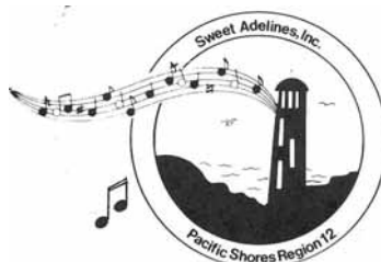
Figure 2: The earliest example I have of the logo in use.