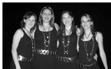
UnderAge backstage at IES 2006

UnderAge, the 2005 Rising Star champions, are growing up! Their second CD is almost ready to be released! They will perform in Gold Standard Chorus' Show for the third year in a row in Santa Cruz on Nov. 4 and for the Bay Area Showcase Show at Flint Center on Dec. 2. They sang in Rhode Island, gave out medals at IES, have been invited to sing at BinG! (barbershop in Germany) Convention in March 2008. UnderAge has