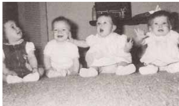
The Four Tots quartet babies get an early start in barbershop!